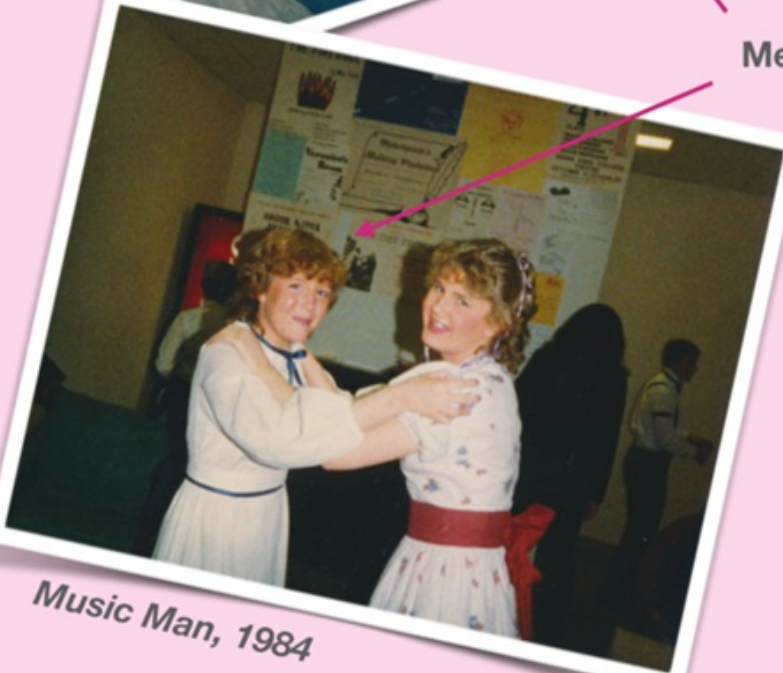
Music Man, 1984