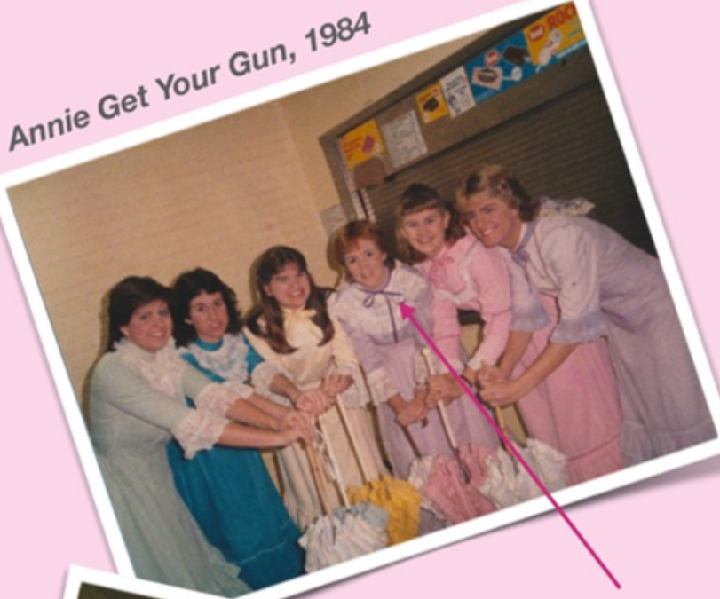
Annie Get Your Gun, 1984